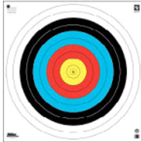
60 cm used in unsighted & sighted divisions